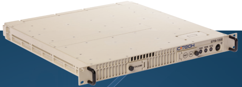
DEVSAT-EPM-1000 Single Channel

AUGMENTING YOUR GOVERNMENT SATELLITE RESOURCES by OFFERING MILITARY GRADE PROTECTION