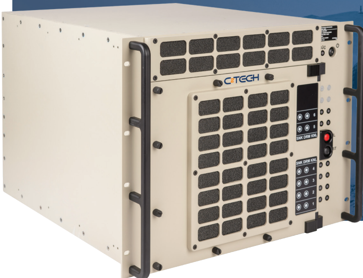
DEVSAT-EPM-8000 Multi Channel

AUGMENTING YOUR GOVERNMENT SATELLITE RESOURCES by OFFERING MILITARY GRADE PROTECTION